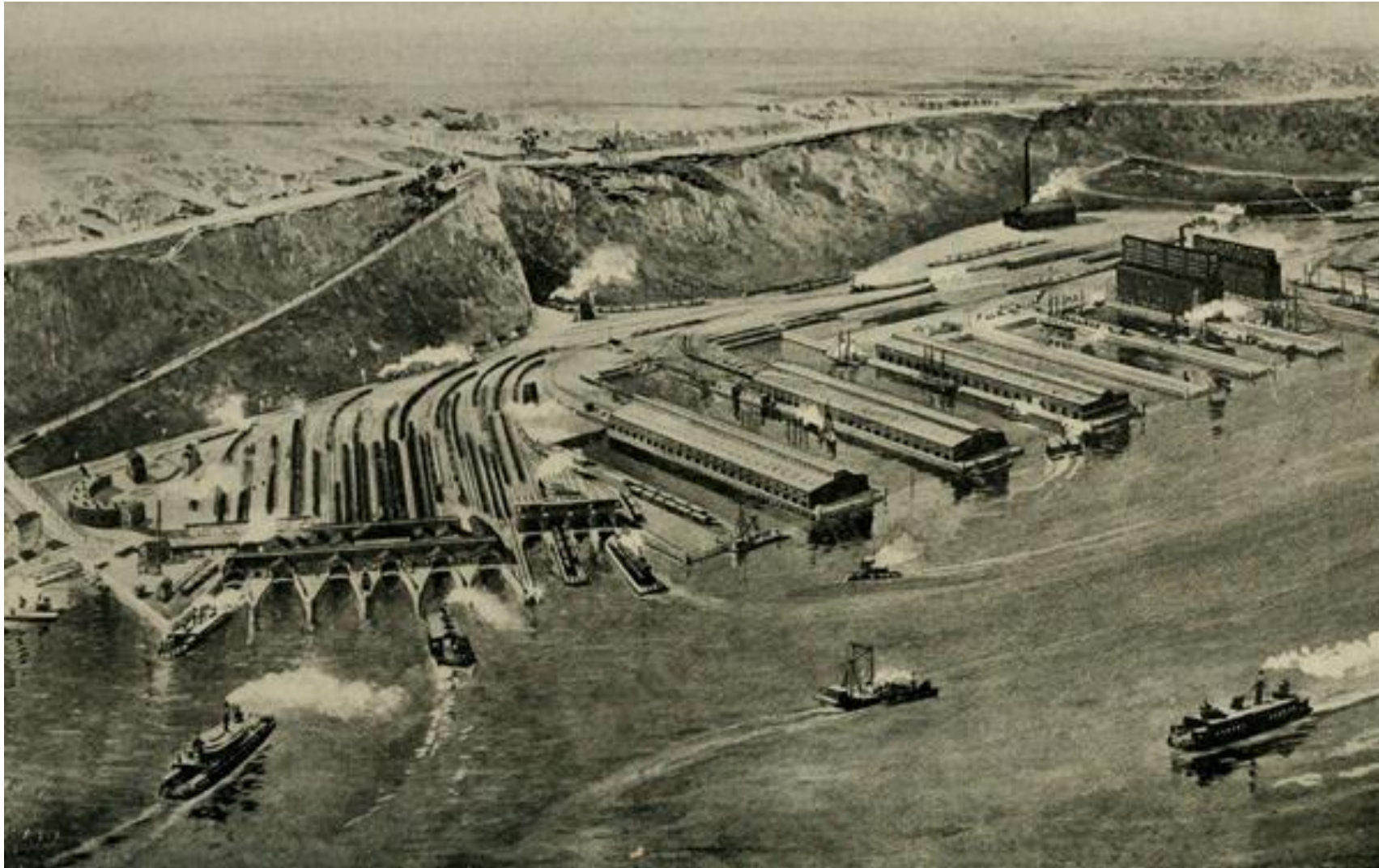
1906: Future NY Waterway Jamestown Ferry Terminal And Maintenance Facility Site