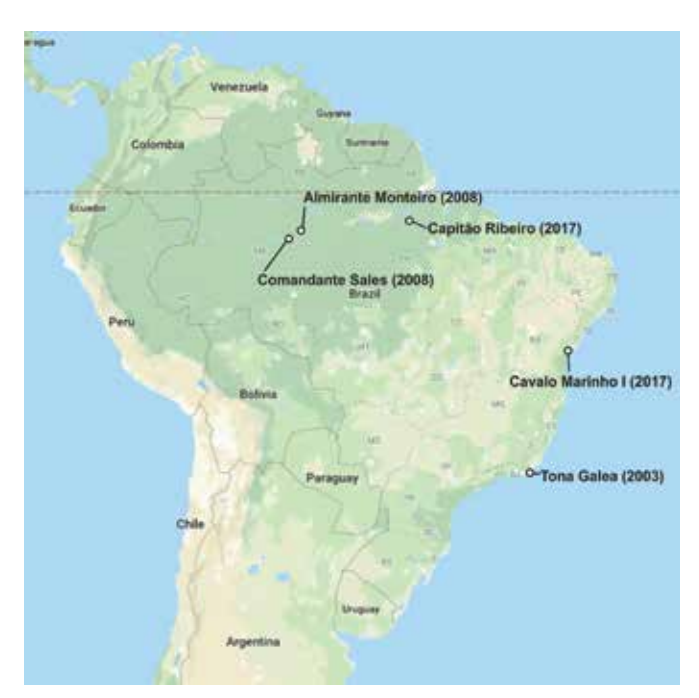
Locations of the shipwrecks covered in the text.

"BR Fostering Short Sea Shipping," project P127925 by The World Bank Group, 2011. Go to http://projects.worldbank.org/P127925/br-fostering-short-sea-shipping?lang=en