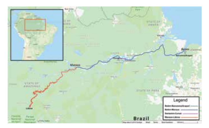
Routes and locations in the North region.